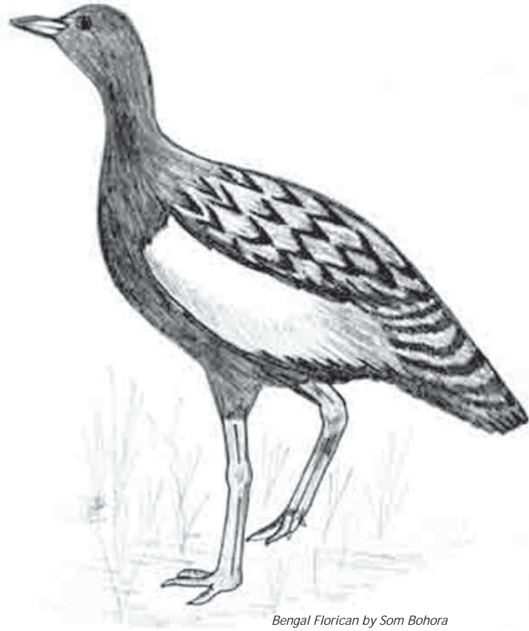
Bengal Florican

A total of 28-36 adult population of Bengal Florican was estimated in the three protected areas of Nepal. Inskipp and Inskipp (1983) estimated 60-86 adult population in 1982 and Baral et al (2003) estimated 32-60 adult population in 2001.