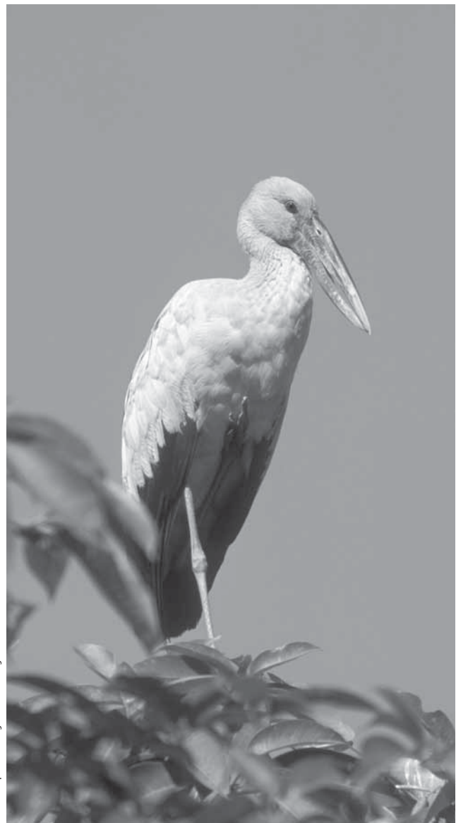
Asian Openbill

Lumbini Buddha Garden Resort, Lumbini Parsa, Rupandehi rubythroat11@yahoo.com