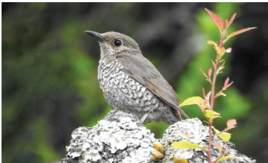
Blue-capped Rock Thrush, Photo: Shambhu Bhattarai