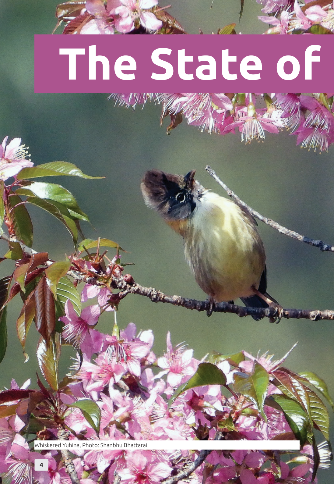
Whiskered Yuhina