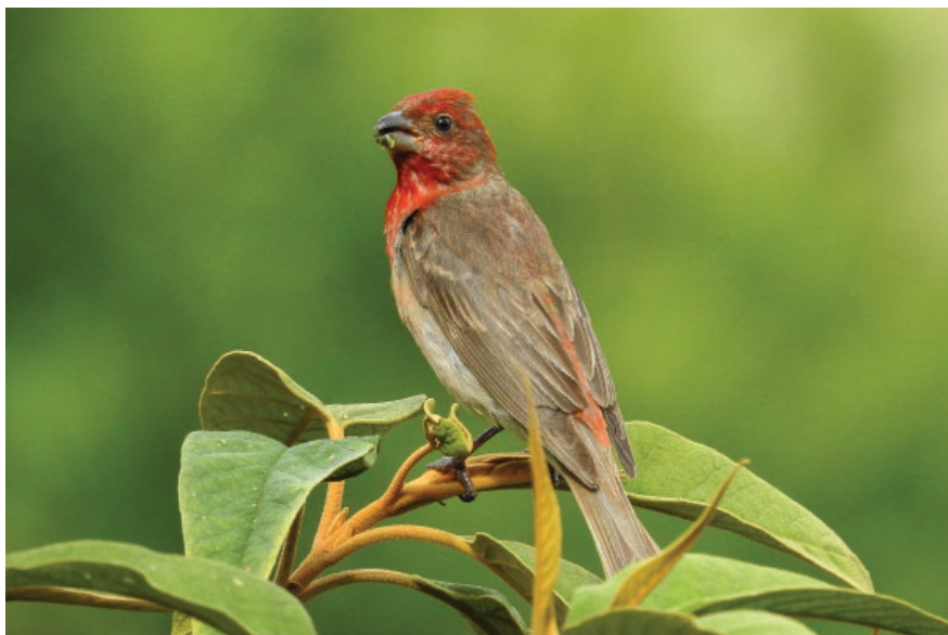
Common Rosefinch, Photo: Shanbhu Bhattarai