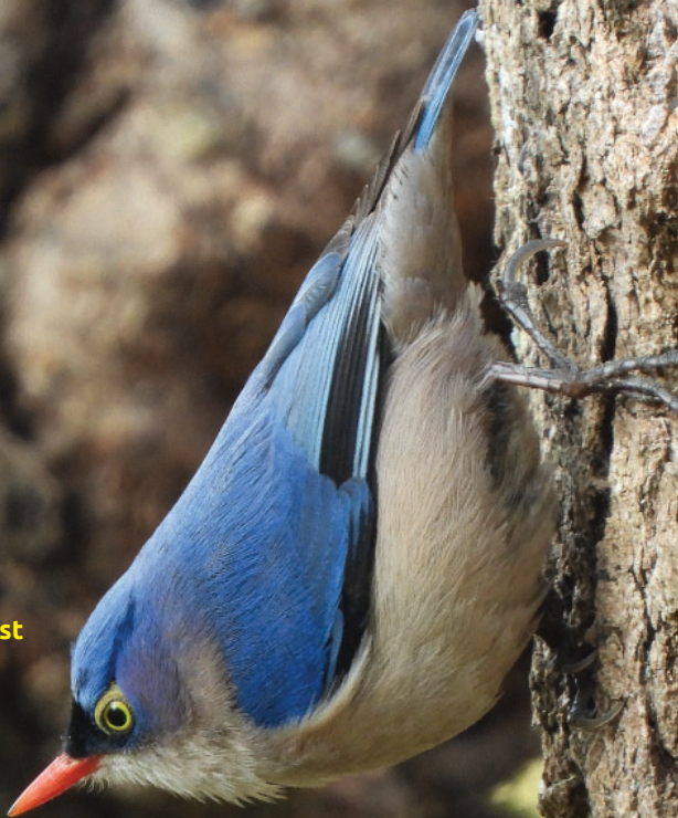
Velvet-fronted Nuthatch, Photo: Shambhu Bhattarai