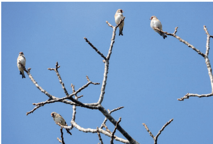
Eastern Goldfinch