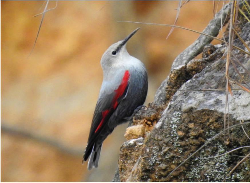
Wall Creeper

species: Hoary-throated Barwing Sibia nipalensis , Nepal Cupwing Proeopyga immaculate , Spiny Babbler Acanthoptila nipalensis (endemic species), Cheer Pheasant Catreus wallichii and Red-headed Tit Aegithalos iredalei . There are 83 biome-restricted species. Similarly, 2 species fall under Appendix I, 30 species fall under Appendix II and 2 species fall under Appendix III of CITES. There are 13 nationally threatened bird species and the number of nationally protected bird species recorded from Madane protected forest area is 3.