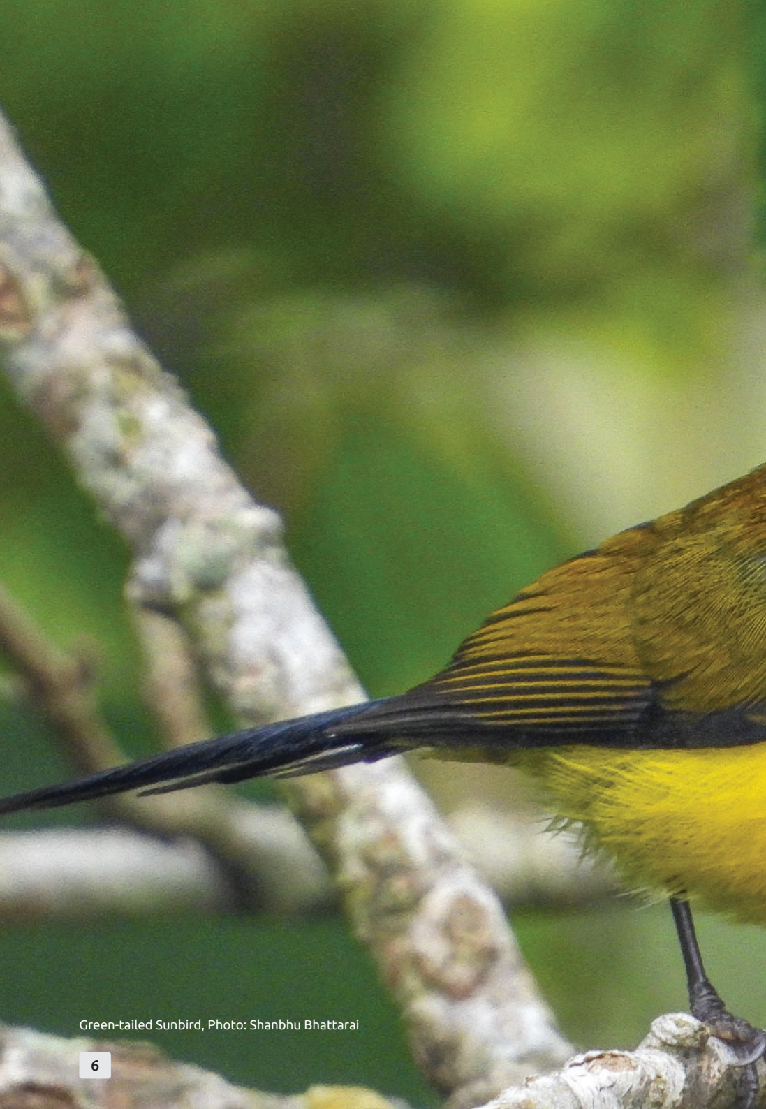
Green-tailed Sunbird, Photo: Shambhu Bhattarai