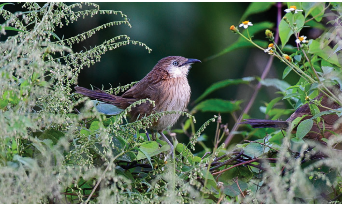
Spiny Babbler