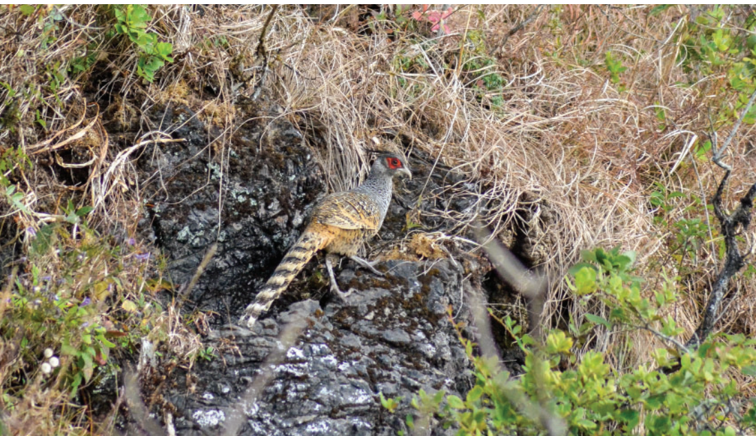
Cheer Pheasant, Photo: Mitra Pandey