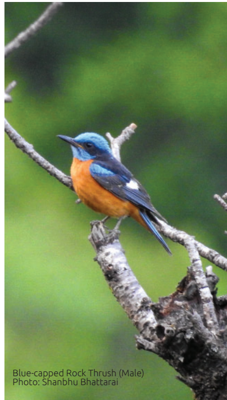
Blue-capped Rock Thrush (Male)