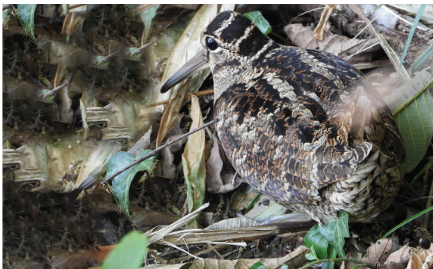
Eurasian Woodcock, Photo: Shanbhu Bhattarai