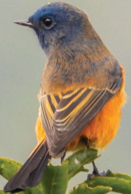
Blue-fronted Redstart