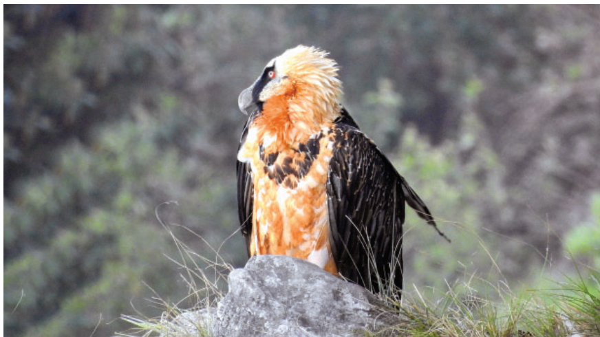
Bearded Vulture, Photo: Shanbhu Bhattarai