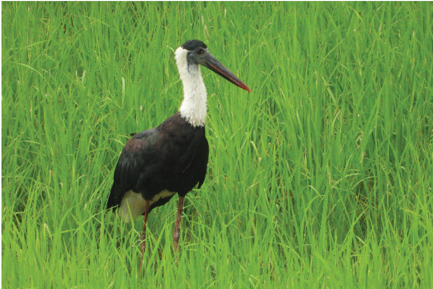
Asian Wollyneck, Photo: Shanbhu Bhattarai