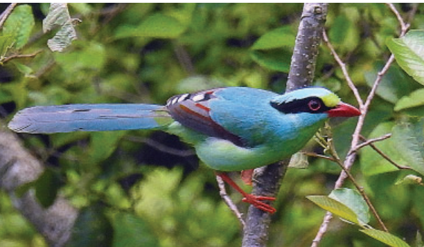
Common Green Magpie, Photo: Hari Basnet

The Madane Protected Forest is managed through different approaches. There are 56 community forests, 8 leasehold forest, many private forests and the core area at higher elevation is managed as a core protected zone (Baral and Dulal 2073). However, there are many forested areas at lower elevations and there is high pressure on the core area for fodder harvesting, especially oak. Some of the conservation threat in the area are habitat destruction, overharvesting of natural resources, forest fires and illegal hunting. Division Forest Office and local Community Forest User Groups are putting their efforts to address the conservation threats. In order to address the threat issue and for the sustainable resource management and protection of wildlife, BCN with support from Dansk Ornitologisk Forening and in coordination with Division Forest Office, Gulmi has implemented 'Integrating livelihoods and Conservation – People Partner with Nature for sustainability' program from 2018 to 2021. However, more efforts from all stakeholders is required for long term conservation.