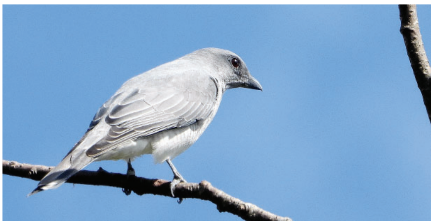
Large Cuckooshrike, Photo: Shanbhu Bhattarai