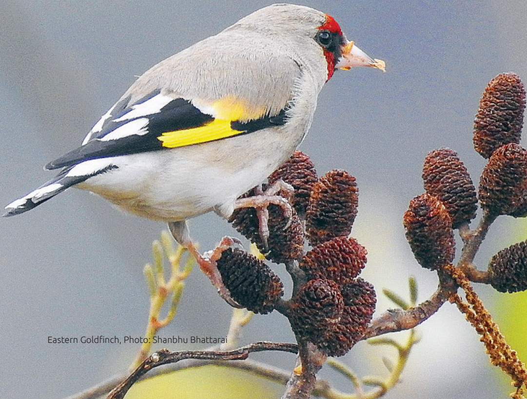
Eastern Goldfinch, Photo: Shambhu Bhattarai