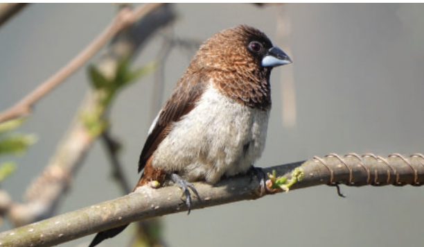
White-rumped Munia