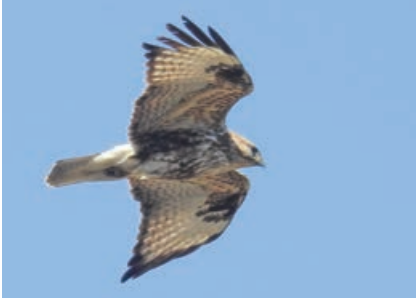
Upland Buzzard by Shambhu Bhattarai