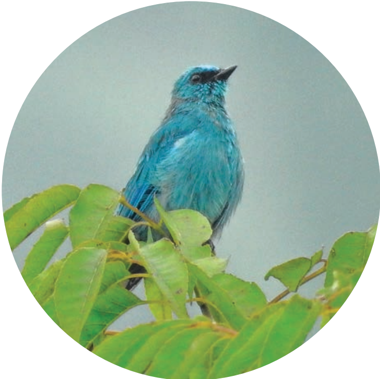
Verditer Flycatcher by Shambhu Bhattarai

Resunga Forest is located in the Gulmi District of Lumbini Province, West Nepal (Map 1) within 28°08' N, 83°27' E. The core forest covers an area of 3400 ha which is also an Important Bird and Biodiversity Area. Resunga protection forest area covers different places (Badagaun, Paralmi, Balithum, Jubhung, Gaudakot, Dubichaur, Simichaur, Tamghas, Arkhale and Hastichaur) with an altitudinal range of 800 m - 2348 m. In 2018, the government declared Resunga as a protection forest area. Resunga is a mountain with historical, religious, cultural, touristic, environmental and archeological value. Resunga forest is a part of an important watershed as 252 water sources have been estimated in the Resunga area, which is the main source of drinking water for local people (Panthi, 1984). Resunga forest is a store-house of diverse wildlife and wild plants ranging from sub-tropical to temperate climatic zones in the mid-hill physiographic region. On the lower slope there is a lower temperate mixed broadleaved forest and on the higher slope Rhododendron forest still exists in good condition (Sharma 2015, Baral and Inskipp 2005).