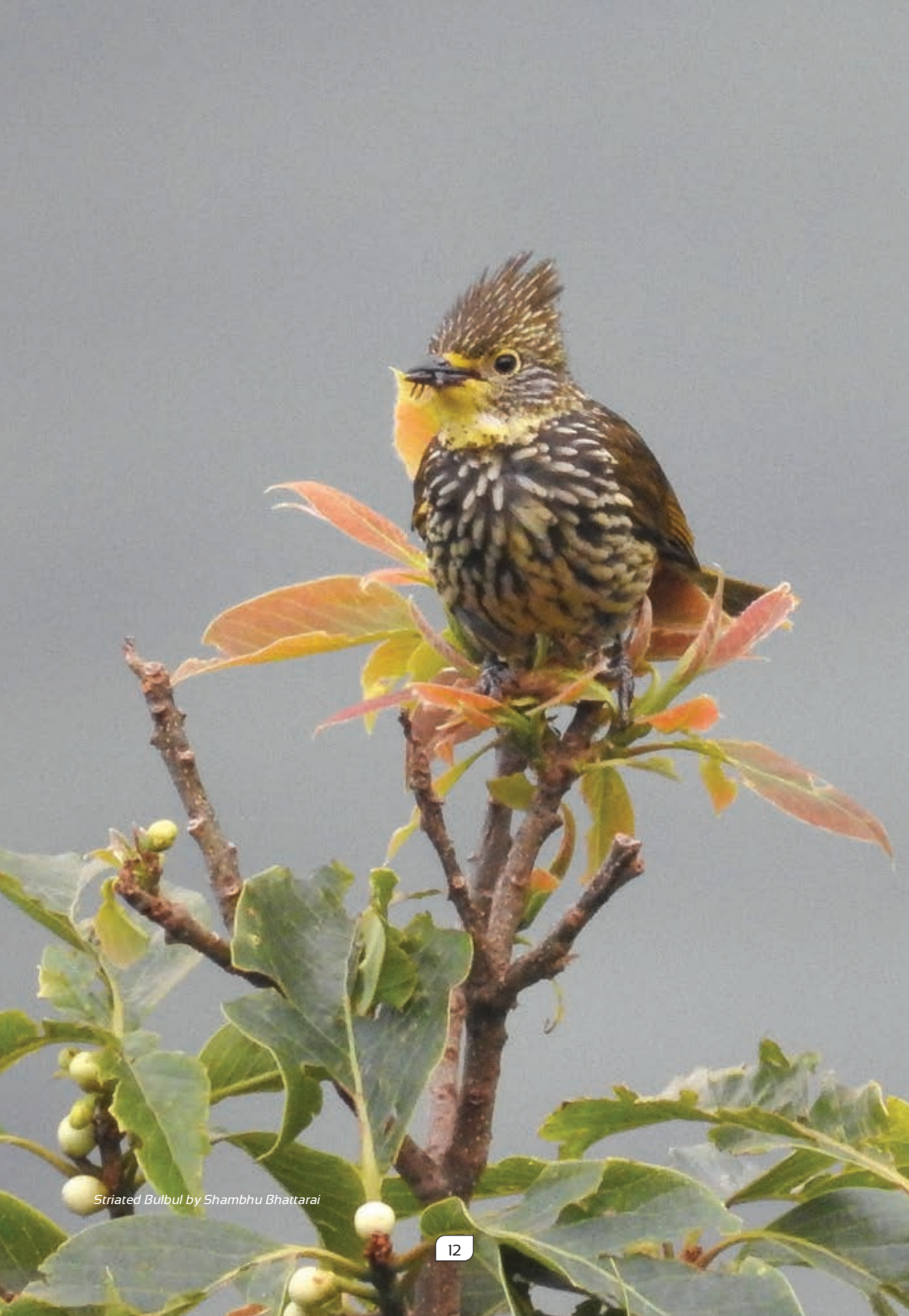
Striated Bulbul by Shambhu Bhattarai