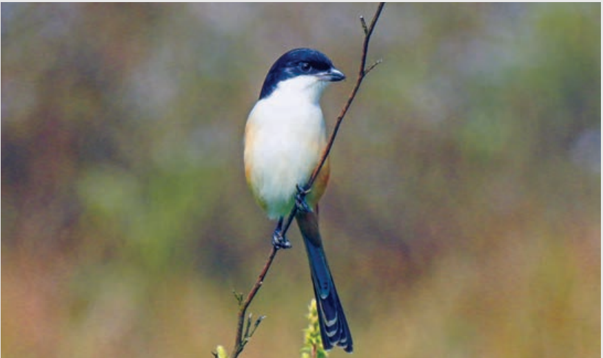
Long-tailed Shrike