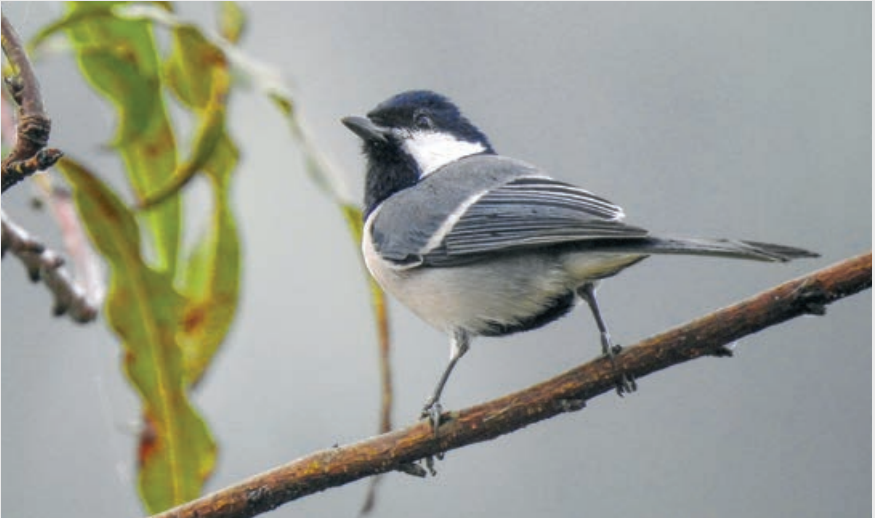
Great Tit