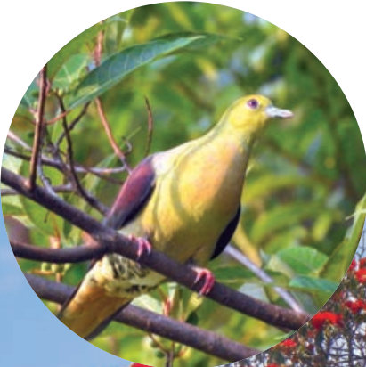
Wedge-tailed Green-pigeon by Shambhu Bhattarai

This systematic list provides all the confirmed bird records from Resunga Protection Forest area. It is based on the bird survey carried out by BCN with national and international bird experts in different seasons and years. A total of 253 birds are recorded at Resunga Protection Forest area representing 15 order and 56 bird families. The most numerous birds come from the Muscicapidae (30 species) followed by Accipitridae (21), Phylloscopidae (19 species) and Leiotrichidae (16).