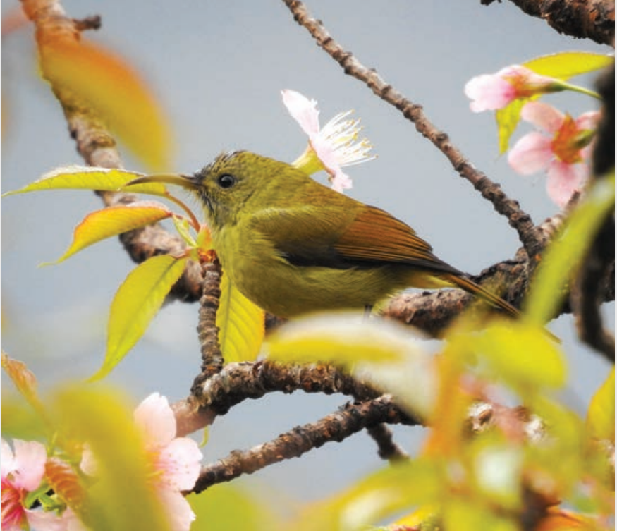
Fire-tailed Sunbird by Shambhu Bhattarai