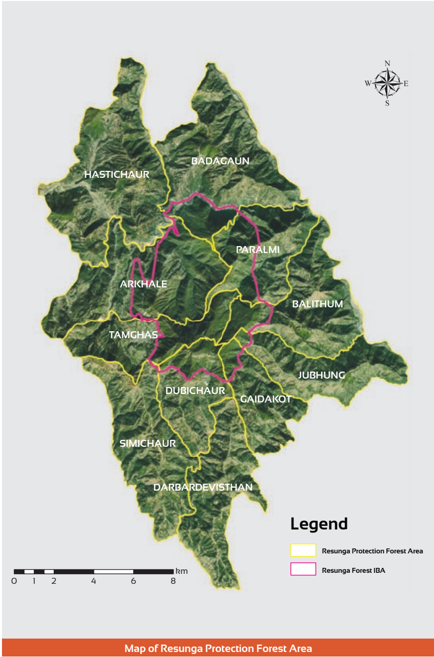
Map of Resunga Protection Forest Area