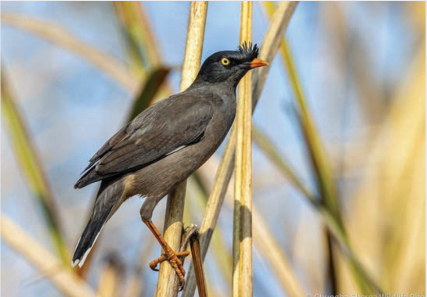
Jungle Myna