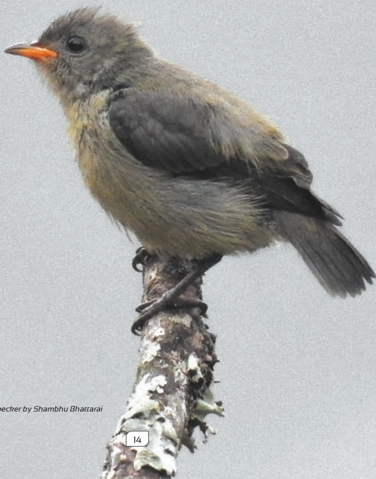
Fire-breasted Flowerpecker by Shambhu Bhattarai