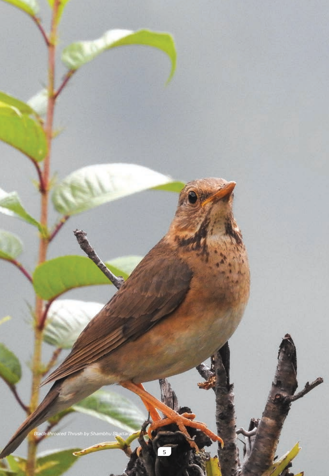
Black-throated Thrush by Shambhu Bhattara