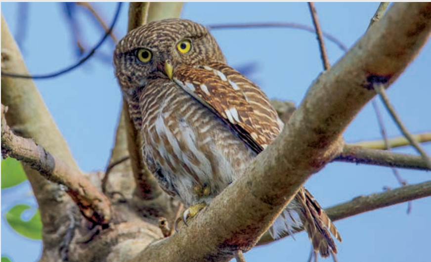
Asian Barred Owlet