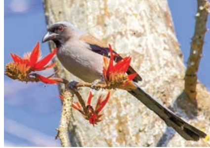
Grey Treepie by Deu Bahadur Rana

The Resunga protection forest is identified as Important Bird and Biodiversity Area by BCN under Birdlife International criteria. Egyptian Vulture Neophron percnopterus , White-rumped Vulture Gyps bengalensis , Red-headed Vulture Sarcogyps calvus , Steppe Eagle Aquila nipalensis , Eastern Imperial Eagle Aquila heliaca and Cheer Pheasant Catreus wallichii are six globally threatened species found in the forest. The forest is also important for three restricted-range species Kashmir Nuthatch Sitta cashmirensis , Spiny Babbler Acanthoptila nipalensis and Cheer Pheasant Catreus wallichii . Nationally threatened status of the birds includes a total of 15 species: 3 Critically Endangered, 7 Vulnerable and 5 Endangered. Likewise, 31 Species are listed in CITES (3 in Appendix I, 27 in Appendix II and 1 in Appendix III). In addition, there are 83 biome-restricted bird species.