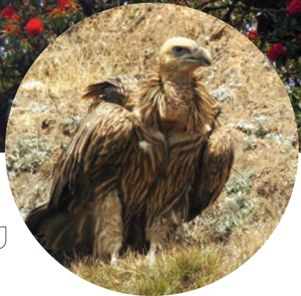
Himalayan Griffon by Shambhu Bhattarai