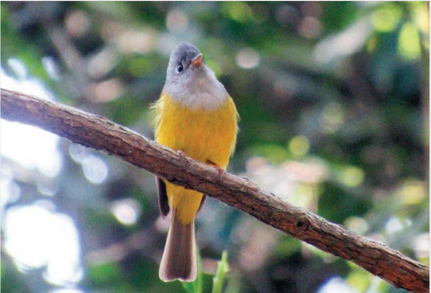
Grey-headed Canary-flycatcher