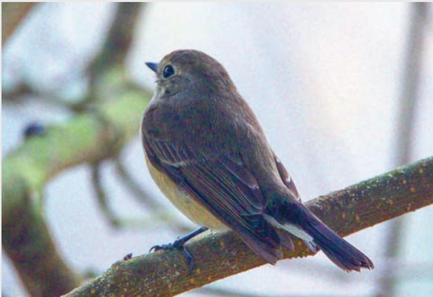
Red-throated Flycatcher by Deu Bahadur Rana