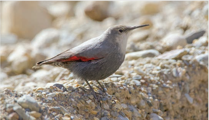
Wallcreeper by Deu Bahadur Rana