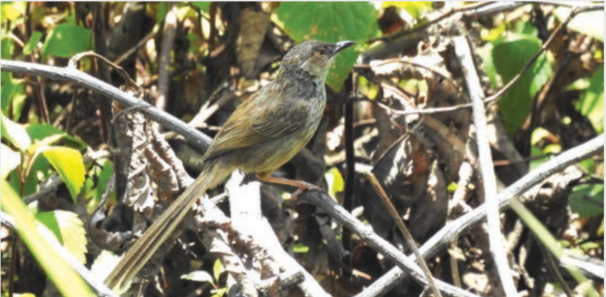
Striated Prinia by Shambhu Bhattarai