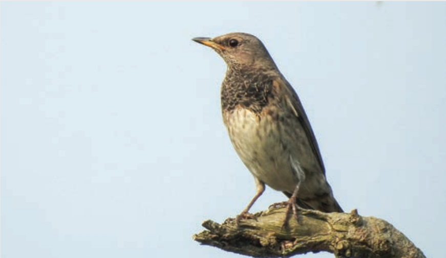
Black-throated Thrush by Ankit Bilash Joshi