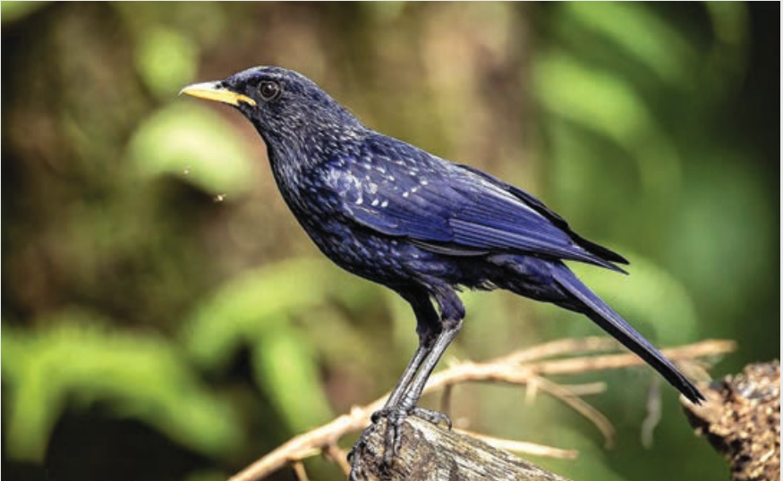
Blue Whistling-thrush by Chungba Sherpa