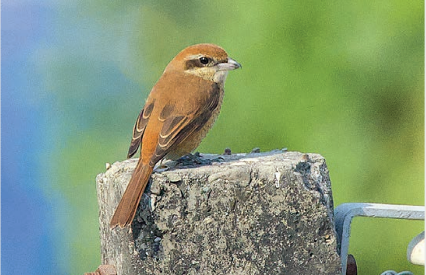
Brown Shrike