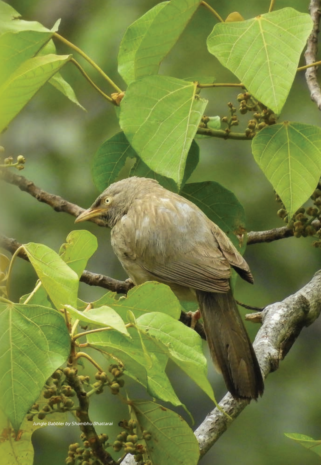
Jungle Babbler by Shambhu Bhattarai