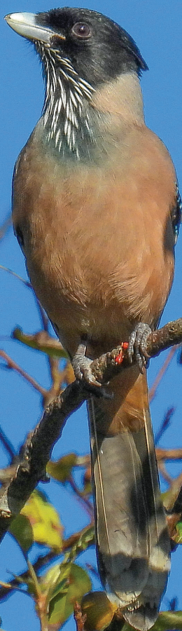
Black-headed Jay by Nabaraj Pokharel