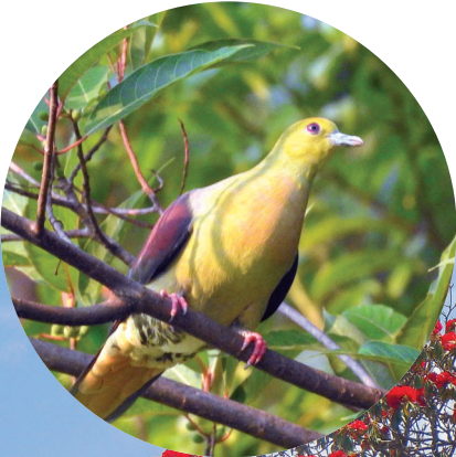
Wedge-tailed Green-pigeon by Shambhu Bhattarai

This systematic list provides all the confirmed bird records from Resunga Forest Conservation Area. It is based on the bird survey carried out by BCN with national and international bird experts in different seasons and years. A total of 285 birds are recorded at Resunga Forest Conservation Area representing 17 order and 64 bird families. The most numerous birds come from the Muscipidae (32 species) followed by Accipitridae (21), Leiotrichidae (16) and Phylloscopidae (14 species).