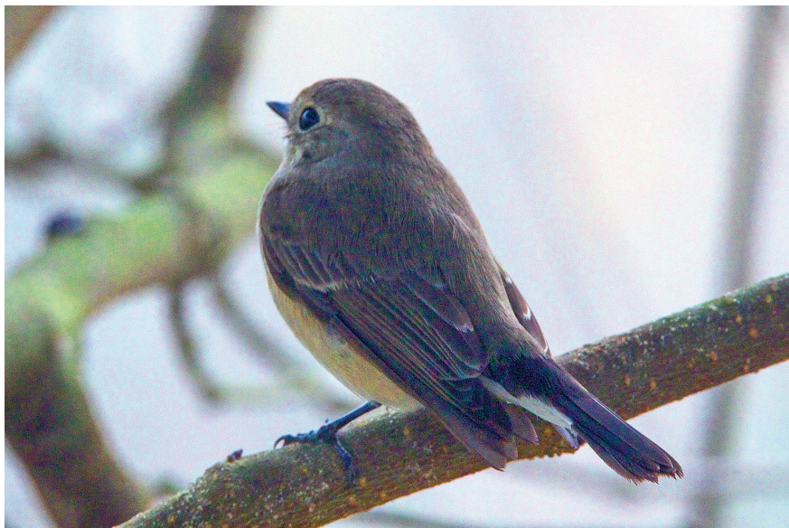
Red-throated Flycatcher by Deu Bahadur Rana