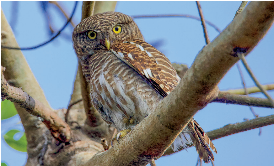
Asian Barred Owlet