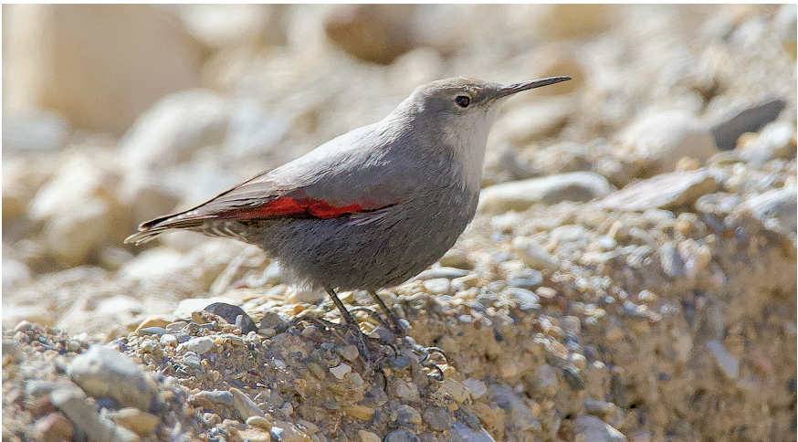
Wallcreeper by Deu Bahadur Rana