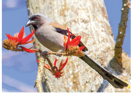
Grey Treepie by Deu Bahadur Rana

The Resunga Forest Conservation Area is identified as Important Bird and Biodiversity Area by BCN under Birdlife International criteria. Egyptian Vulture Neophron percnopterus , White rumped Vulture Gyps bengalensis , Red-headed Vulture Sarcogyps calvus , Steppe Eagle Aquila nipalensis , Eastern Imperial Eagle Aquila heliaca and Cheer Pheasant Catreus wallichii are six globally threatened species found in the forest. The forest is also important for four restricted-range species Kashmir Nuthatch Sitta cashmirensis , Spiny Babbler Acanthoptila nipalensis , Hoary-throated Barwing Sibia nipalensis and Cheer Pheasant Catreus wallichii . Nationally threatened status of the birds includes a total of 18 species: 4 Critically Endangered, 5 Endangered and 9 Vulnerable. Likewise, 37 Species are listed in CITES (3 in Appendix I, 32 in Appendix II and 2 in Appendix III). In addition, there are 87 biome-restricted bird species.