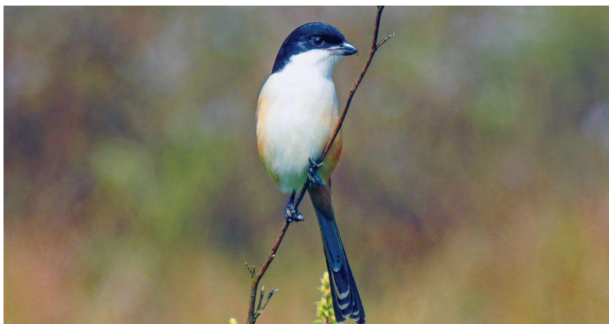
Long-tailed Shrike