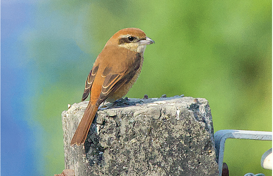
Brown Shrike