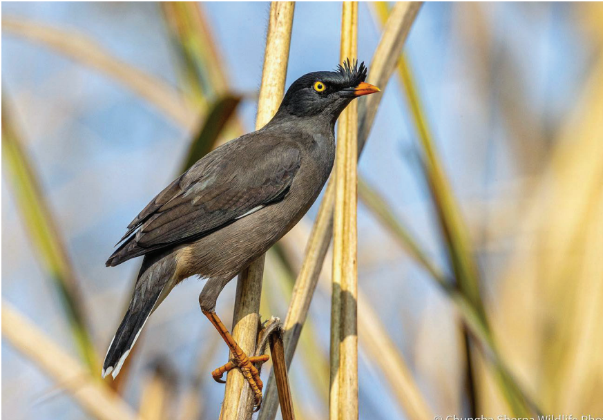
Jungle Myna