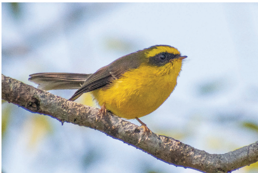
Yellow-bellied Fairy Fantail