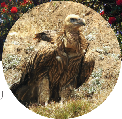
Himalayan Griffon by Shambhu Bhattarai