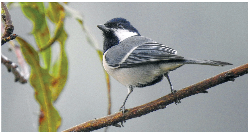
Great Tit