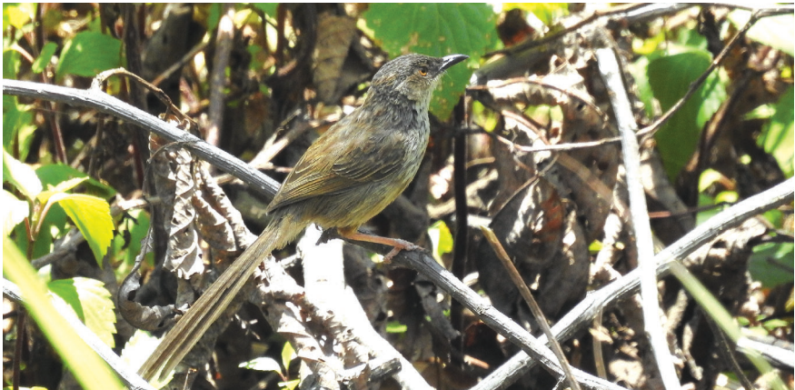
Striated Prinia by Shambhu Bhattarai