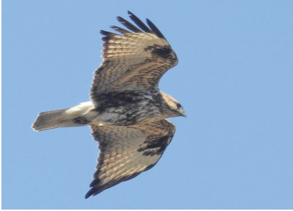
Upland Buzzard by Shambhu Bhattarai