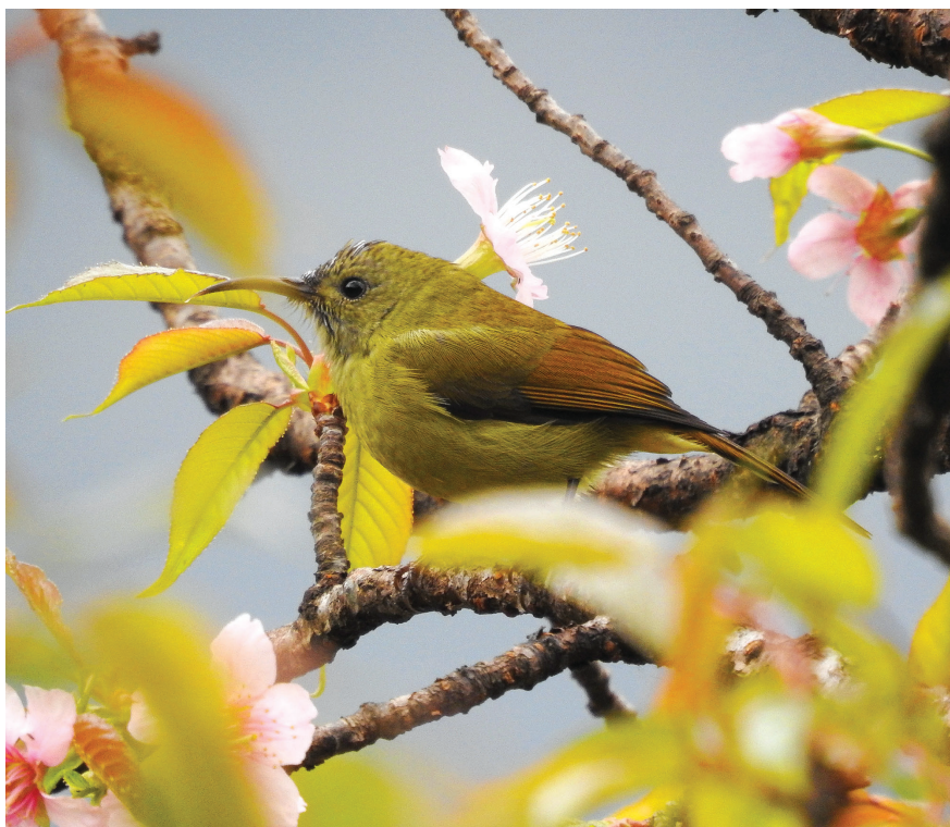
Fire-tailed Sunbird by Shambhu Bhattarai