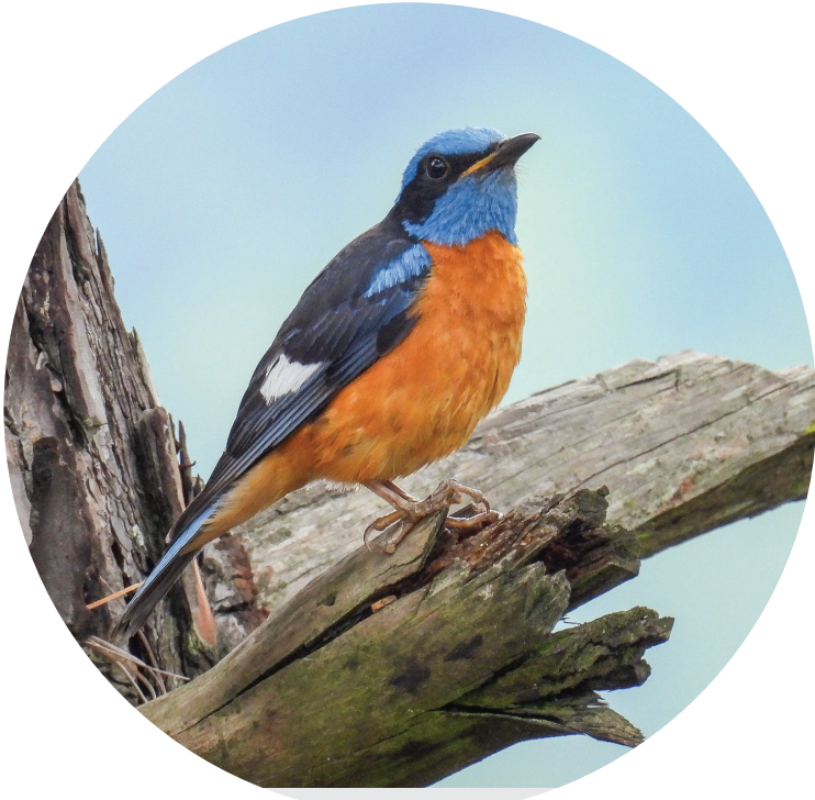
Blue-capped Rock-thrush by Nabaraj Pokharel

Resunga Forest is located in the Gulmi District of Lumbini Province, West Nepal (Map 1) within 28°08' N, 83°27' E. The core forest covers an area of 3400 ha which is also an Important Bird and Biodiversity Area. Resunga forest conservation area covers different places (Badagaun, Paralmi, Balithum, Jubhung, Gaudakot, Dubichaur, Simichaur, Tamghas, Arkhale and Hastichaur) with an altitudinal range of 800 m - 2348 m. In 2018, the government declared Resunga as a Resunga Forest Conservation Area. Resunga is a mountain with historical, religious, cultural, touristic, environmental and archeological value. Resunga forest is a part of an important watershed as 252 water sources have been estimated in the Resunga area, which is the main source of drinking water for local people (Panthi, 1984). Resunga forest is a store-house of diverse wildlife and wild plants ranging from sub-tropical to temperate climatic zones in the mid-hill physiographic region. On the lower slope there is a lower temperate mixed broadleaved forest and on the higher slope Rhododendron forest still exists in good condition (Sharma 2015, Baral and Inskipp 2005).