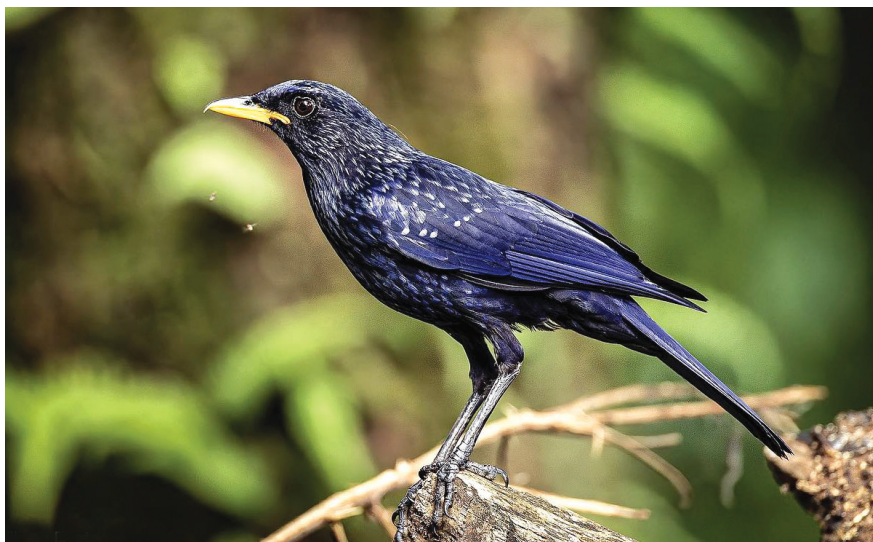
Blue Whistling-thrush by Chungba Sherpa