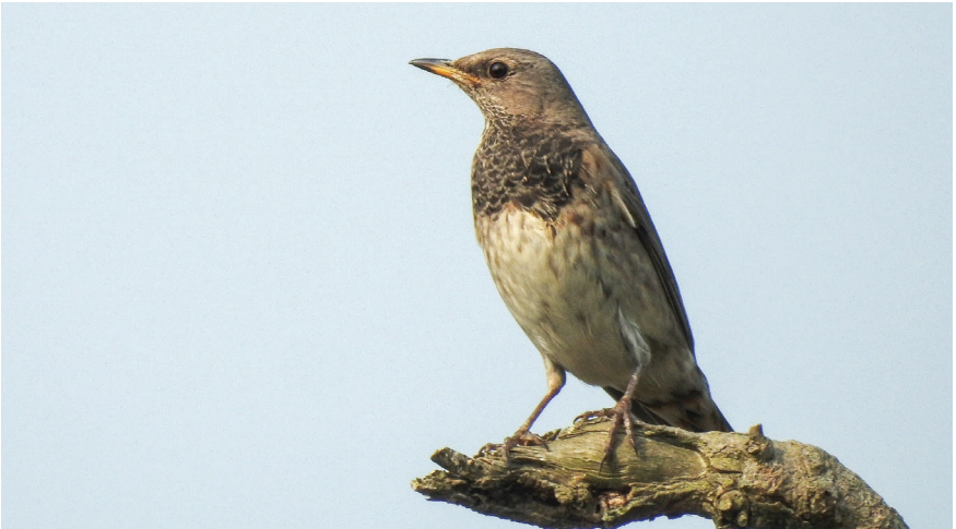
Black-throated Thrush by Ankit Bilash Joshi